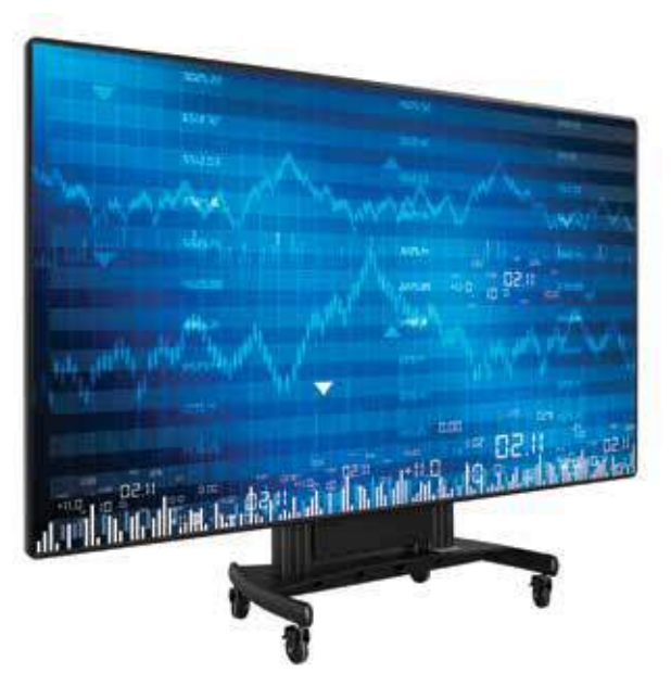
*Mounting frame optional