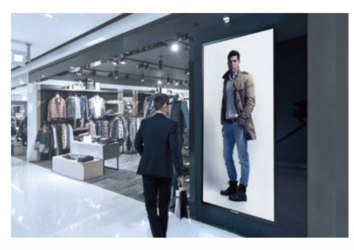
Product details and textures are very true-to-life. The outstanding expression of the large 4K display effectively captures attention.