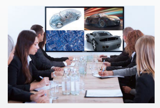
The large-screen display provides clear visibility even for meetings with a lot of people attending, and high-definition images are ideal for design and simulation use.