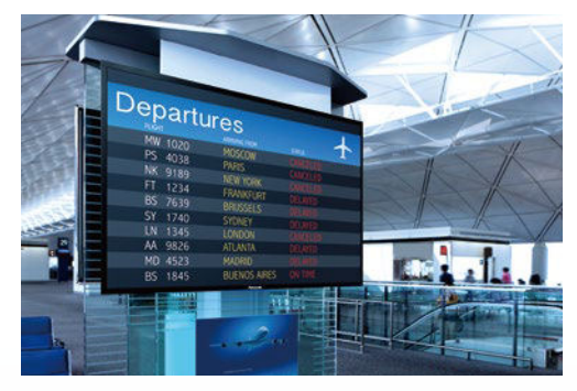
The high-resolution screen is ideal for fine text in airport flight displays and train schedules. The rugged design also provides excellent durability.