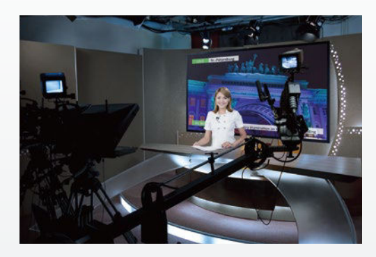
The beautiful 4K large screen provides sharp, real-life images. Color temperature can be set from 3000K to 11500K. And an optional terminal board enables SDI connection, ideal for broadcast station or studio use.