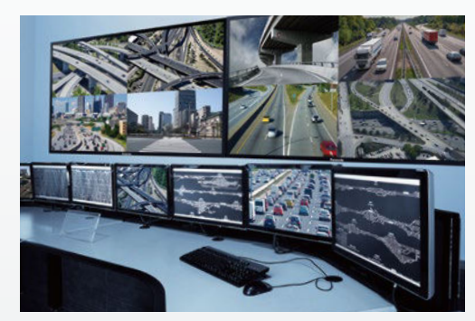
The high resolution and large screen size make previously difficult-to-see images sharp and clear. It's ideal for monitoring, because even slight movements can be easily detected. It's also fully capable of 24/7 operation.